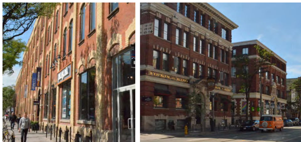
PICTURED ABOVE: King Street West neighbourhood