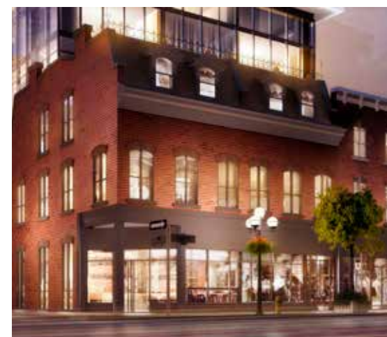
TOP RIGHT: Artist's rendering of the corner of Cumberland Street elevation. BOTTOM RIGHT AND COVER: Artist's rendering of Yonge Street elevation.